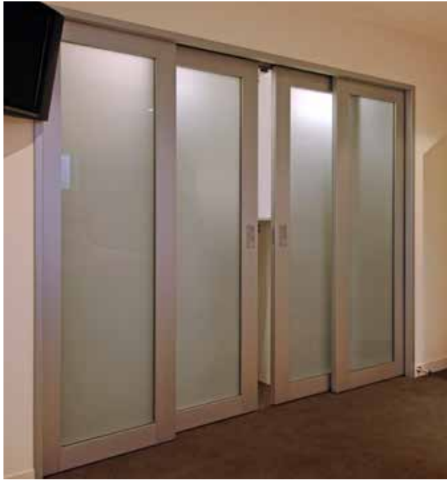
Bi-Parting OvertakingDoors cavity sliders with NewYorker doors

CS TrackSystems and Automatic Units can also be specified as Bi-Parting units.