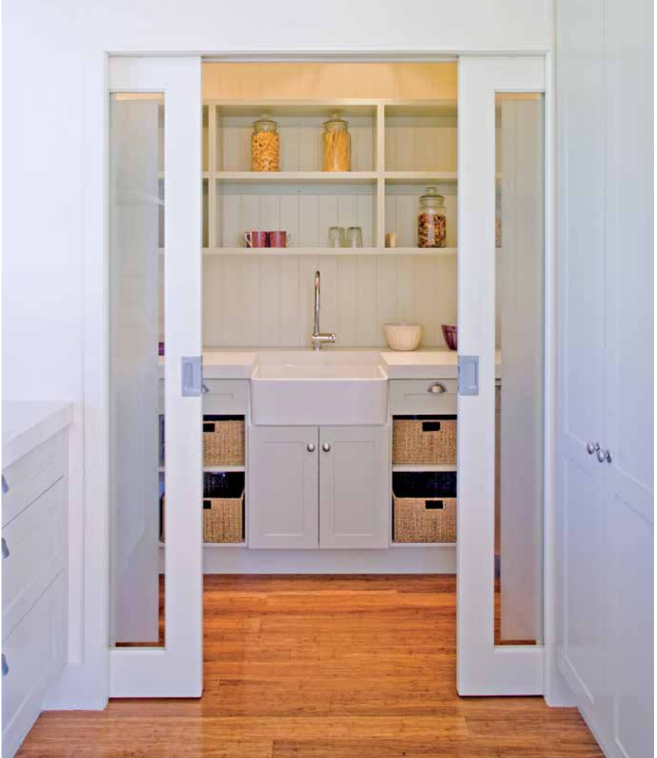
Bi-Parting cavity slider with glazed doors