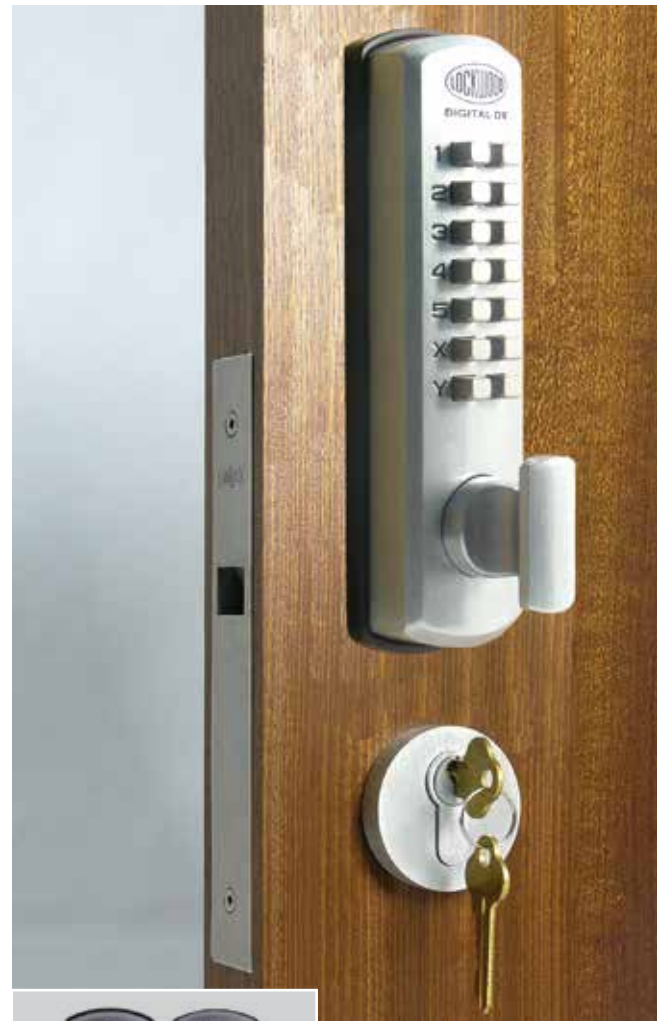
↑ CL 100 DigiLock with key locking fitted to a timber veneer door.