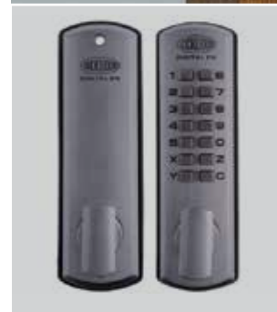
Digital locks are easily programmable to suit pass code of your choice. Full instructions are included.