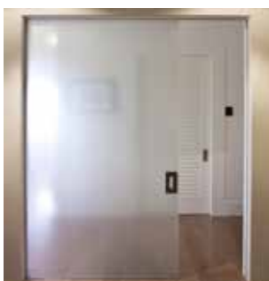
Single with etchlight glass