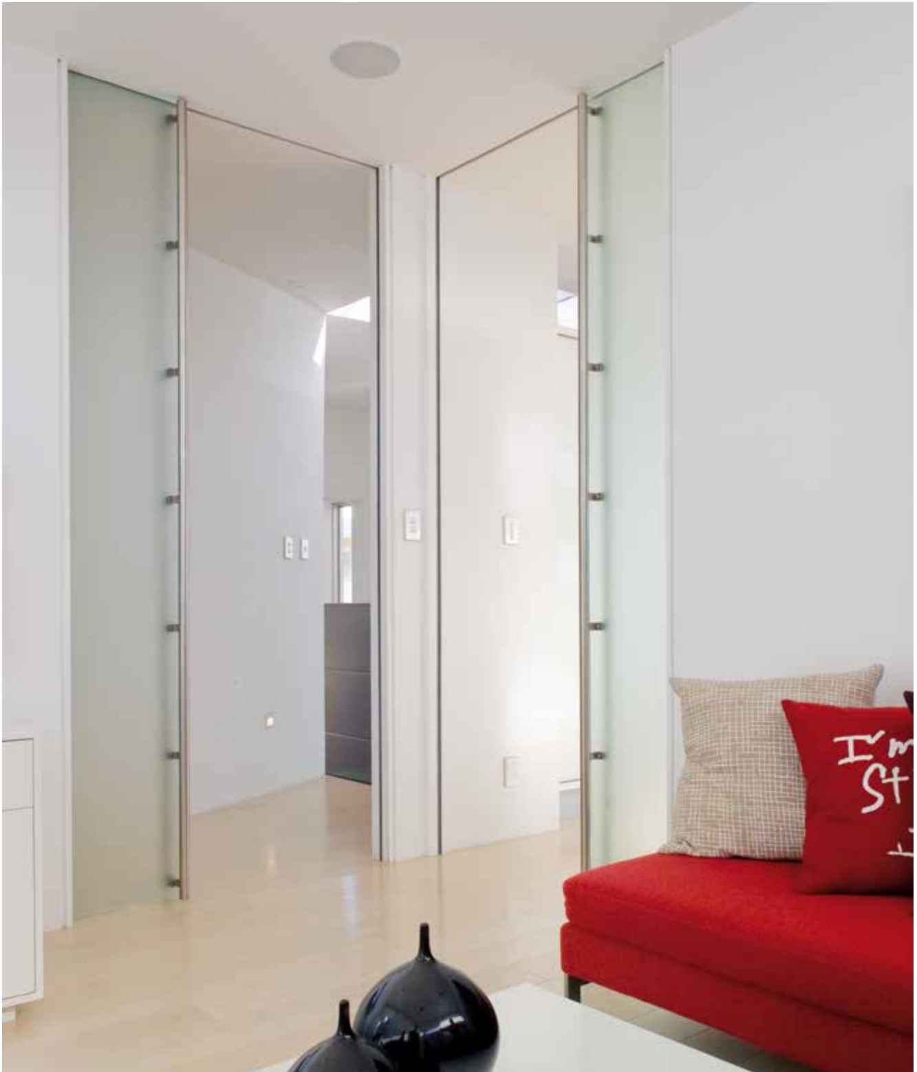
Two CS FramelessGlass Single units with frosted glass doors and custom stainless steel handles fitted