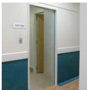
Single with automated door