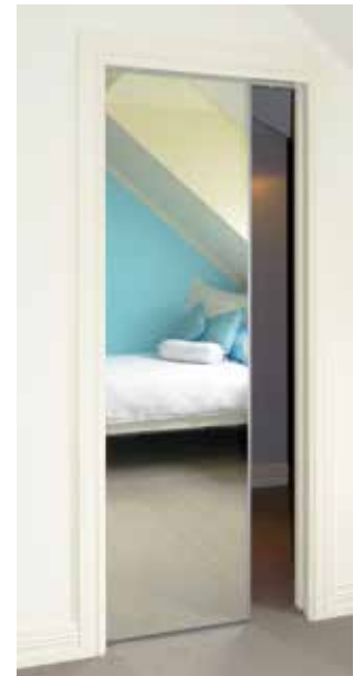
↑ 3 - CS SpaceMaker cavity slider with CS MirrorLite door leading to a walk in wardrobe.

It is perfect for situations where a mirror door is required.