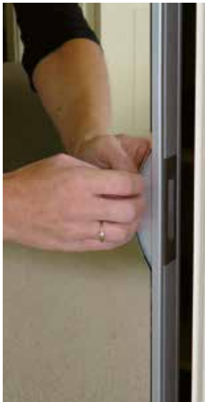
▲ 4 - Recessed side grips allow the door to slide fully back into the pocket.