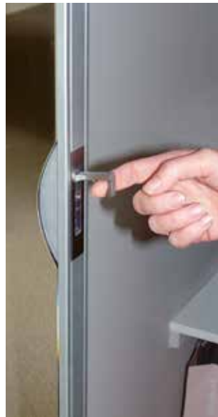
▲ 5 - Flush front edge pull makes door retrieval from the pocket easy.