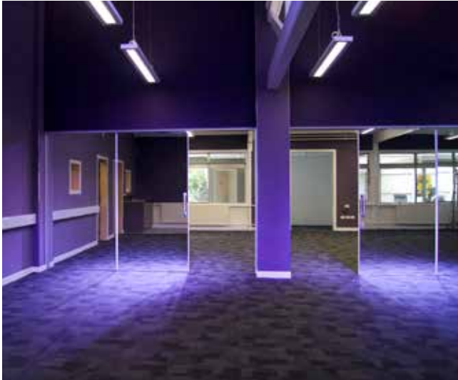
↑ 1 - Two sets of CS AluSealed Cavity Sliders with 2.1m x 3.3m CS Mirrorlite doors joined using the CS Actalink system.

The unique design of the CS MirrorLite allows the mirror to cover the entire face of the door to within 9mm of the front and rear edges. When fitted to a CS Cavity Slider all clashing are hidden when the door is in the closed position.