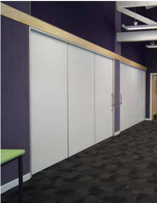
↑ 2 - The opposite face of the doors are paint finish.

CS MirrorLite is a pre-finished high quality double sided mirror door for residential or commercial use.