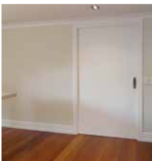
Single with grooved door