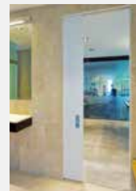
Solid Core Timber Doors

Can be specified with a range of door options including CS DoorLeaves .