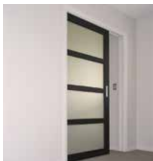
Single with New Yorker door