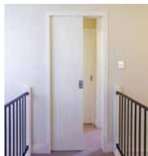
Single with grooved door