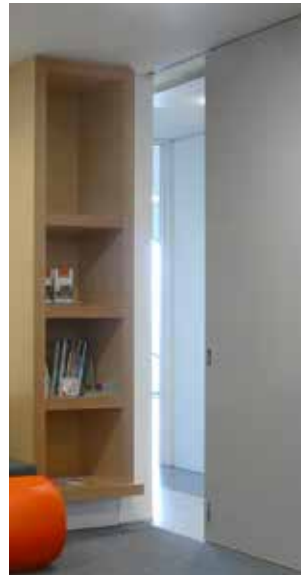
Tower bolt on CS AluTec door.

Centred 300mm from the bottom of the door and 29mm backset from the front edge.