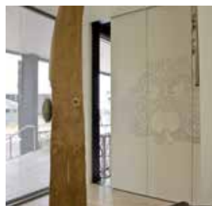
4m high x 3m wide Ultimate