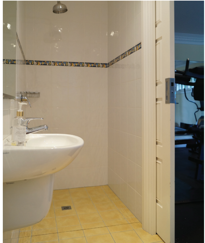
CS TimberFormed with custom joinery door